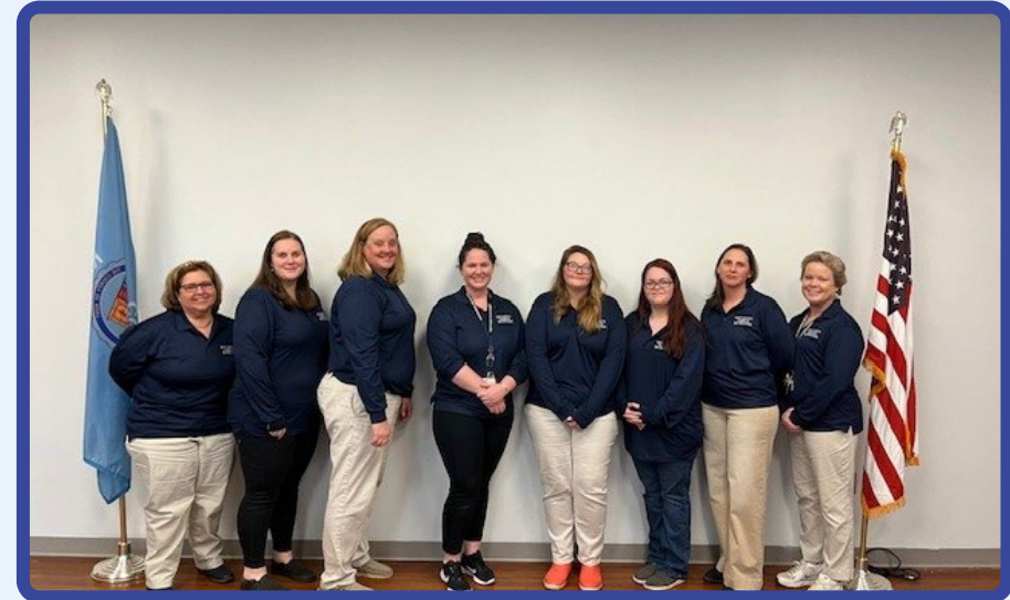
Recreation Program Team