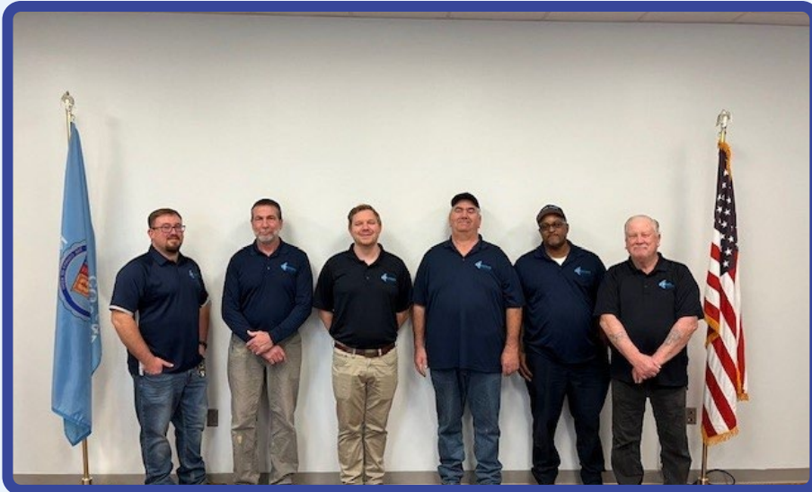
Department of Public Works Team