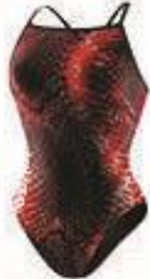
1 piece Bathing Suit