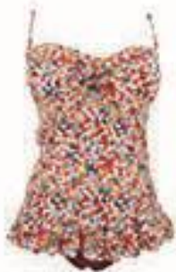
2 piece Tankini