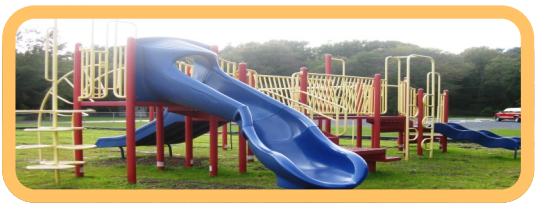
Edesville Park Playground

Fees are based on Kent County residency. KCPR reserves the right to require proof of identity-name, residency-address and age. Patrons who do not provide proof documentation will not be permitted to make a reservation. Patrons who indicate they are a resident and do not provide proof if requested will be required to pay the non-resident rate.